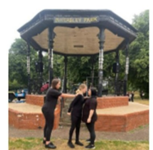
Springboard Future Chef